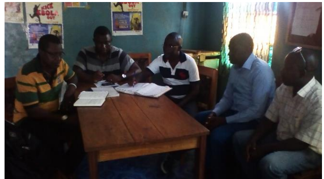
A cross-section of Executive Members of the Bo District Human Rights Committee at a meeting with PAACET's ARD

The Committee's Executive applauded PAACET for such initiative and committed to work with PAACET to meet the human rights and social justice challenges. It was agreed that the ARD make a detailed presentation of its organizational background and programmes, and how partnership can be enhanced between the two bodies at a general forum. A date and time was set for the presentation and a planning committee of three persons was selected to do a session plan [Agenda] with a modest budget for the presentation forum. Since the Committee was unable to provide the required budget for the forum, PAACET ARD committed to fund the forum at a minimal rate. Responsibilities were assigned for effective coordination.