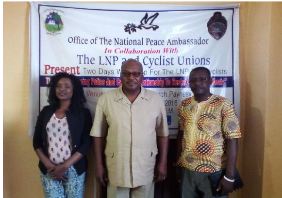
L-R: Young Community Ambassador, the National Peace Ambassador and PAACET ARD.