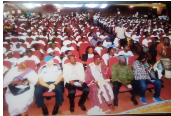
ARD and other dignitaries at the International Day of Peace celebration at the City Hall in Monrovia

Violence to Secure Human Rights” which was held at the Monrovia City Hall.