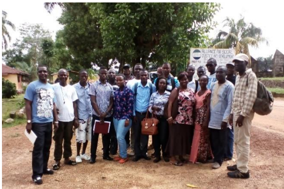
Participants at the Consultative Forum

Organisational thematic programmes were discussed to enable the forum to identify the common areas with PAACET. Training needs were also identified for the Committee's membership. A full report of the session is available on PAACET's website.