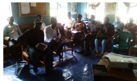
A cross-section of participants at the forum

The session provided an opportunity for the ARD to present PAACET's institutional background, programme of events and potential areas of partnerships and collaboration. A facilitated discussion on the human rights situation, key challenges and what each organisation is doing towards addressing the identified challenges concluded the forum.